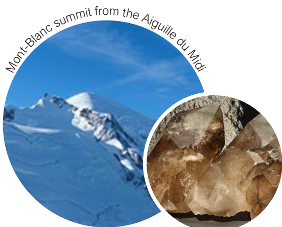
Quartz « fumé » from Mont-Blanc massif