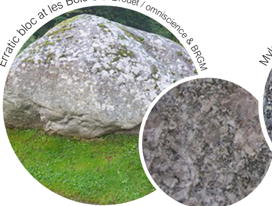
Quartz pockets in Mont-Blanc granite (protogine)

Erratic bloc at les Bois